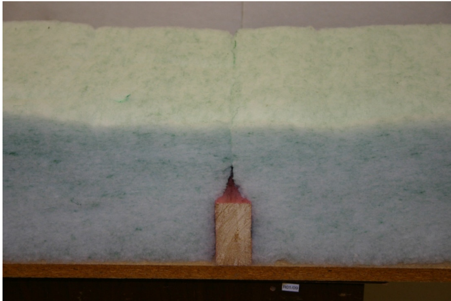
Figure 17: Insulation cut to the width of the space between framing plus twice the width of the frame (2 x 45 mm) and installed with the segments end on to the framing.

In both cases, the insulation closes up very effectively over the top of the framing, and the thermal resistance would be expected to be very close to what would be achieved if the insulation was installed as two layers. For this particular insulation product, these two examples are indistinguishable but because some fibrous insulation products, particular polyester ones, can have a significant polarity in fibre rigidity, this may not always be the case. In one direction, the material may not close over the top of the framing as well as it does when oriented the other way.