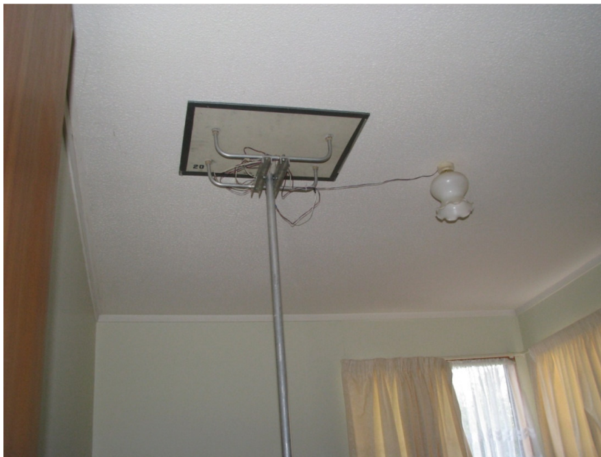
Figure 7: Ceiling C – heat flux transducer in position.