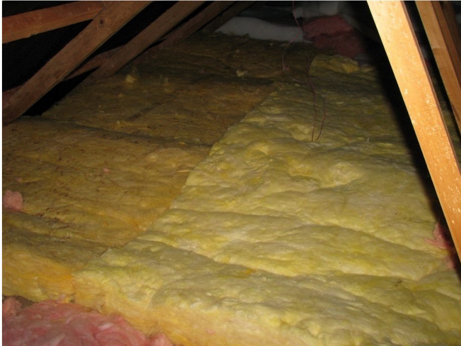
Figure 10: Ceiling A – layer of insulation over framing and second layer between framing