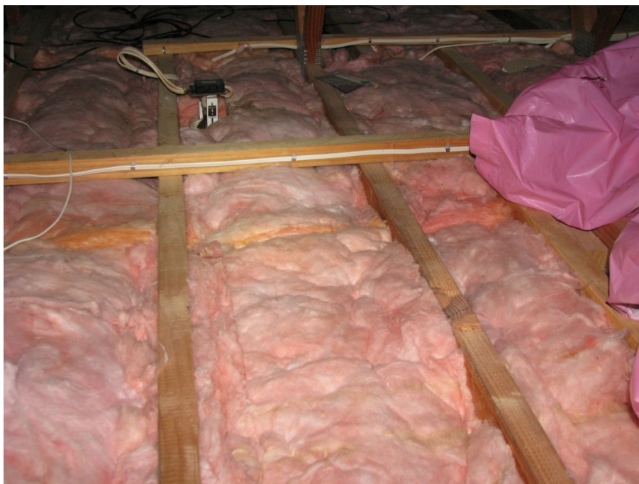
Figure 6: Ceiling C – plastic bags from the original insulation had been left in the ceiling.

The third ceiling (Ceiling C) was in an early 1990s house insulated at the time of construction with nominal R 2.4 glasswool insulation segments – the plastic bags from the insulation had been left in the ceiling (Figure 6). While the installation was better than that of Ceiling B, there was some tucking present. The segments were approximately 90 mm thick. Only one HFT was installed, was placed directly under an area containing both a batten and a joist (Figure 7).