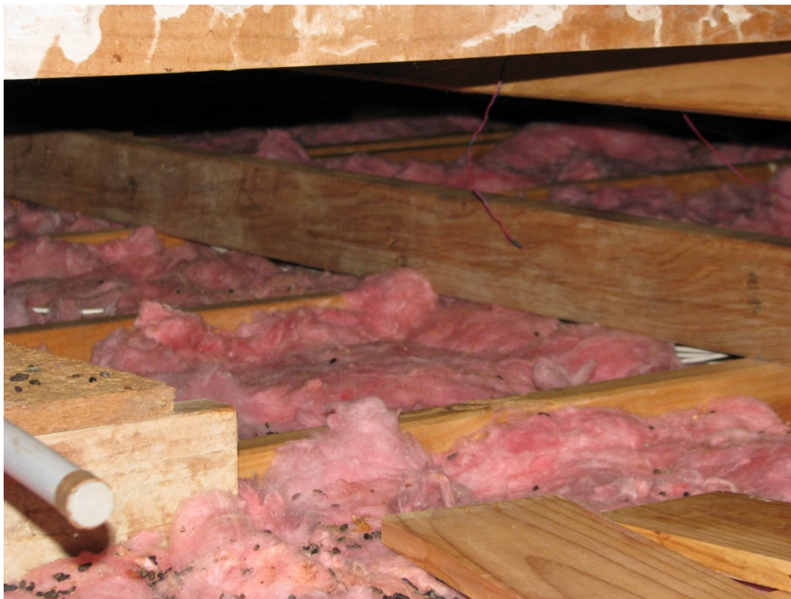
Figure 4: Ceiling B – original insulation poorly installed.

The second ceiling (Ceiling B) was in an early 1970s house that had been retrofitted in the 1980s with glasswool insulation segments. The insulation segments were approximately 70 mm thick and poorly installed, with the widespread presence of tucking and folding (Figure 4). The single HFT was installed directly under an area containing a joist but no dwangs, and the panel was held in place with a purpose-designed stand (Figure 5). The logger was placed on the stand just underneath the HFT panel.