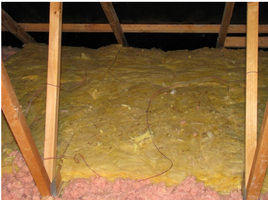
Figure 9: Ceiling A – pieces of insulation friction-fitted between the framing.

A fourth set of measurements was made with more of the same insulation material installed over the top of the framing in addition to the material already friction-fitted between the framing (Figure 10).