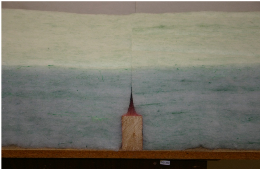
Figure 18: Insulation cut to the width of the space between framing plus twice the width of the frame (2 x 45 mm) and installed with the segments side on to the framing.