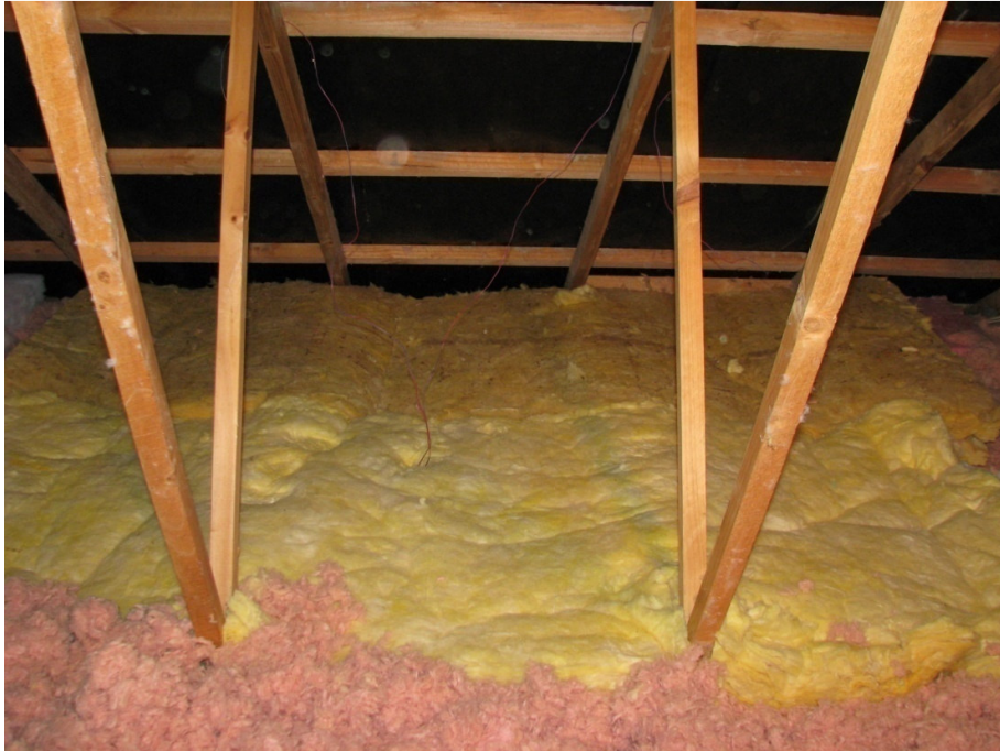
Figure 8: Ceiling A – 120 mm thick R 3.2 glasswool insulation product (roll form) installed over the top of the framing.