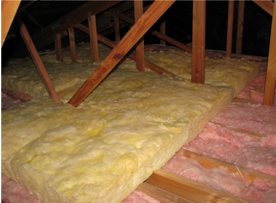
Figure 12: Ceiling C – 120 mm thick R 3.2 glasswool insulation product (roll form) installed over the top of the framing.

After first measuring the thermal resistance of the ceiling with the existing nominal R 2.4 insulation segments, the insulation was removed from the test area and replaced with 120 mm thick R 3.2 glasswool insulation product (roll form) installed over the top of the framing (Figure 12). The thermal resistance was then remeasured. As with Ceiling A, the area near the outer edge of the ceiling contained additional insulation between the framing to prevent ventilation.