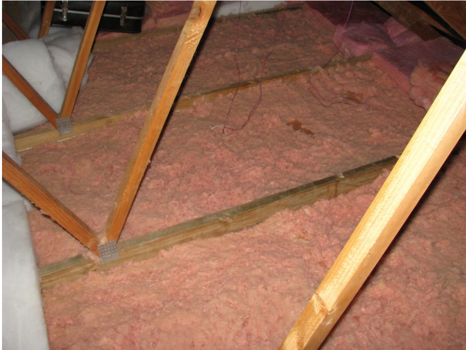
Figure 1: Ceiling A – area 1, batten only.