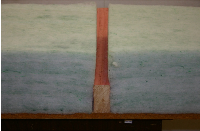
Figure 15: Polyester insulation fitted against framing in the way the R-value has traditionally been calculated using 1-dimensional calculation methods such as NZS 4214.

Figure 16 represents the reality of insulation cut to friction-fit the frame spacing. The width of the insulation is then the width of the space between the framing plus the width of the framing (usually 45 mm). This results in the insulation partially covering over the framing and produces a reduction in thermal bridging from the framing. The thermal bridging from the framing would be expected to be reduced if the insulation thickness is increased, but since there is still a gap in the insulation above the framing, there will still be some convective heat transfer into the ceiling space above the insulation.