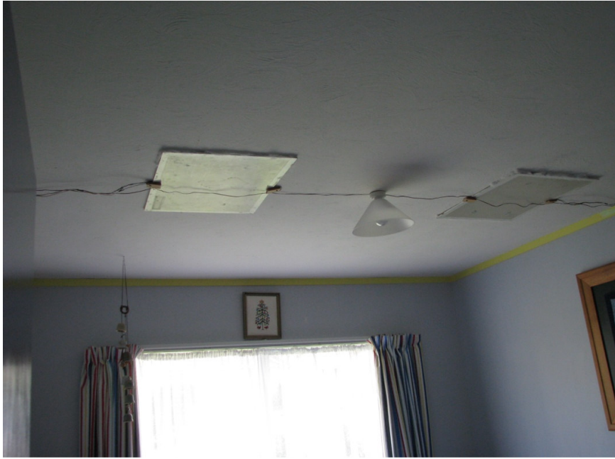
Figure 3: Ceiling A – heat flux transducers in position.

The second ceiling (Ceiling B) was in an early 1970s house that had been retrofitted in the 1980s with glasswool insulation segments. The insulation segments were approximately 70 mm thick and poorly installed, with the widespread presence of tucking and folding (Figure 4). The single HFT was installed directly under an area containing a joist but no dwangs, and the panel was held in place with a purpose-designed stand (Figure 5). The logger was placed on the stand just underneath the HFT panel.