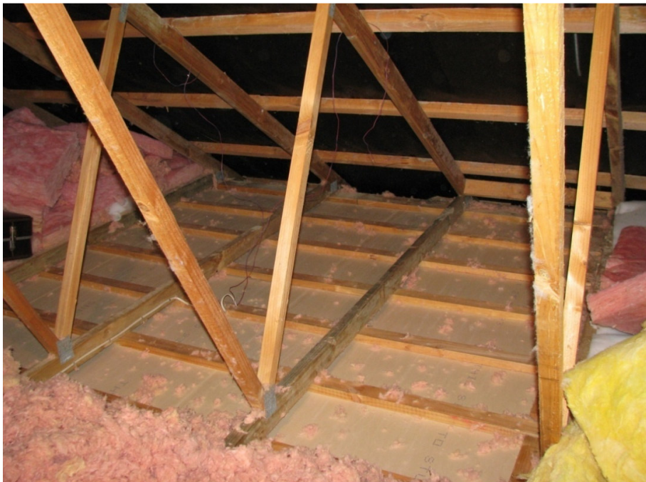
Figure 2: Ceiling A – area 2, batten and joist.