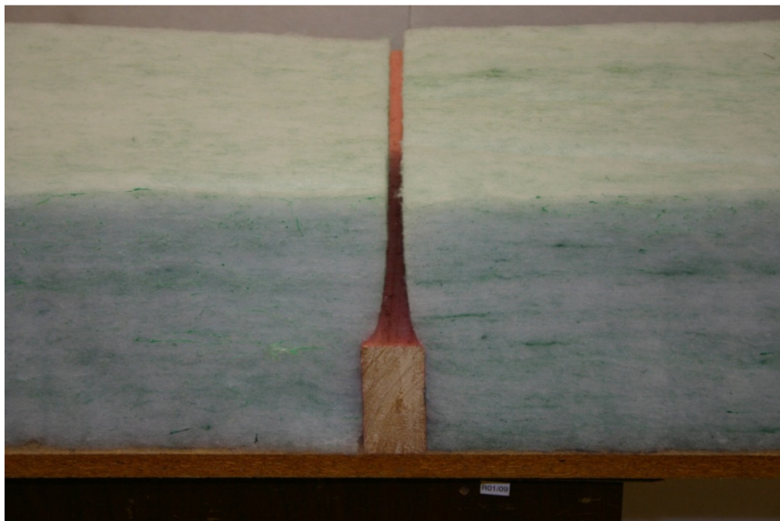
Figure 16: Insulation cut to friction-fit the frame spacing.

Figure 16 represents the reality of insulation cut to friction-fit the frame spacing. The width of the insulation is then the width of the space between the framing plus the width of the framing (usually 45 mm). This results in the insulation partially covering over the framing and produces a reduction in thermal bridging from the framing. The thermal bridging from the framing would be expected to be reduced if the insulation thickness is increased, but since there is still a gap in the insulation above the framing, there will still be some convective heat transfer into the ceiling space above the insulation.