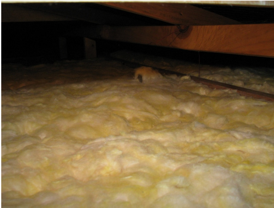
Figure 11: Ceiling B – 120 mm thick R 3.2 glasswool insulation product (roll form) installed over the top of the framing and existing insulation.

After first measuring the thermal resistance of the ceiling with the existing retrofitted insulation segments, the thermal resistance was remeasured with 120 mm thick R 3.2 glasswool insulation product (roll form) installed over the top of the framing and existing insulation (Figure 11).