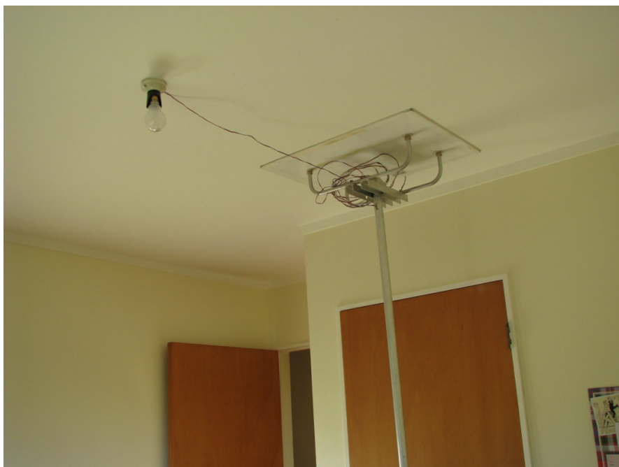
Figure 5: Ceiling B – heat flux transducer in position.

The third ceiling (Ceiling C) was in an early 1990s house insulated at the time of construction with nominal R 2.4 glasswool insulation segments – the plastic bags from the insulation had been left in the ceiling (Figure 6). While the installation was better than that of Ceiling B, there was some tucking present. The segments were approximately 90 mm thick. Only one HFT was installed, was placed directly under an area containing both a batten and a joist (Figure 7).