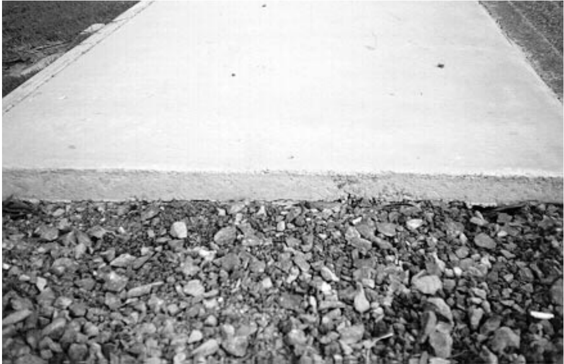
Figure 6. Cross-section of slab.