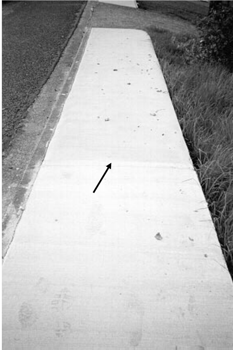
Figure 4. Transition point between the two concretes.