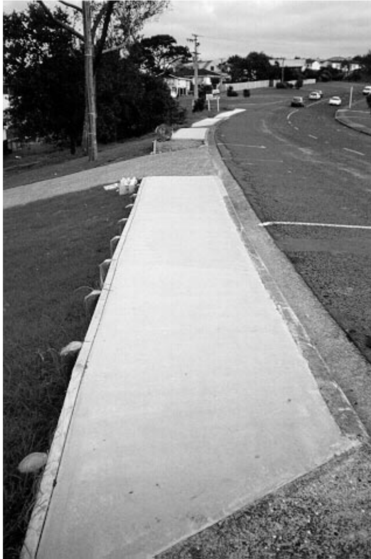
Figure 3. General layout.