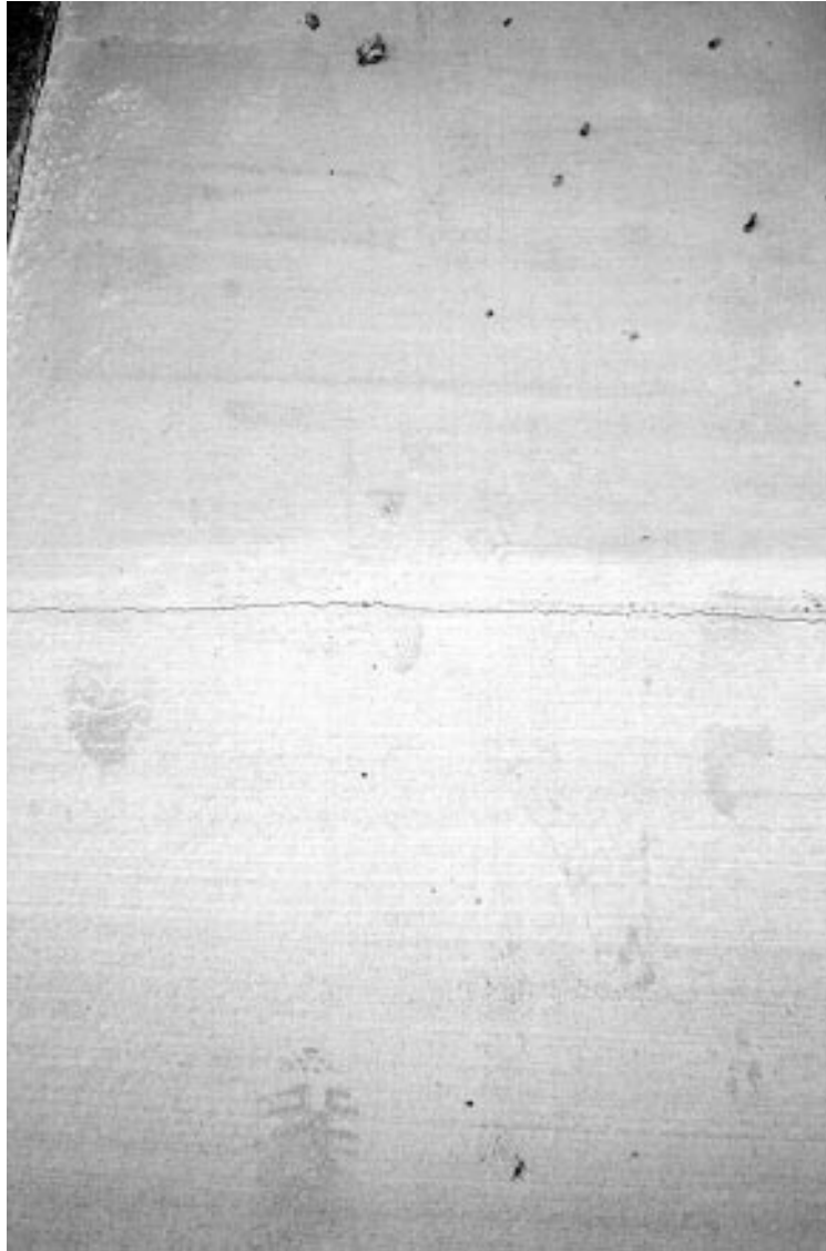
Figure 5. Crack at transition point.