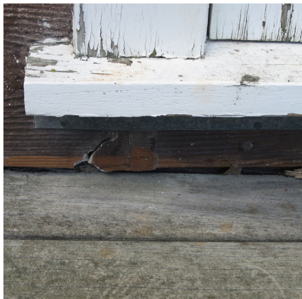
Examples of paint failure.