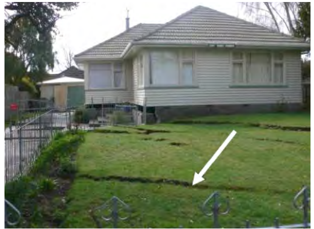
Lateral spreading is clearly visible in the grounds around this house.

2.0.2 Modern buildings generally satisfied these objectives considering the level of shaking.