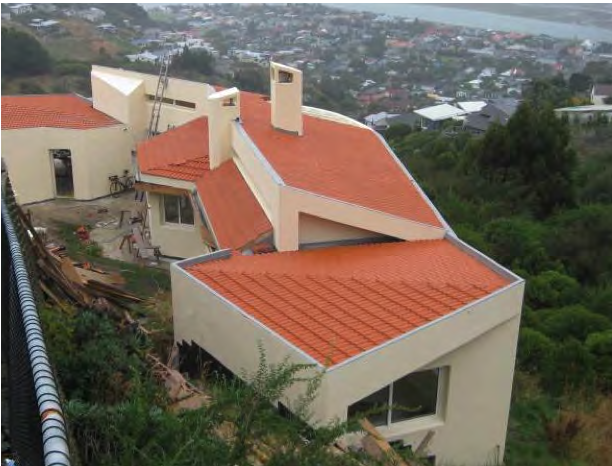
Plan irregularity increases the risk of damage.

6.1.2 The increased complexity comes from the fact that hillside homes are often outside the scope of NZS 3604 Timber-framed buildings – specific engineering design is often required. There may be split levels, plan irregularity and vertical irregularity. These houses can involve a mix of structural systems and stiffness.