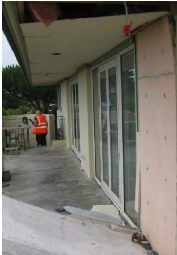
The connections failed on this precast concrete panel.

6.2.3 Good roof and floor design generally hold the building together, but BRANZ observed damage to roof valleys where roof shapes were complex.