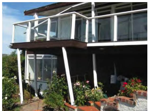
There were many examples of ground slumping/sliding affecting houses.