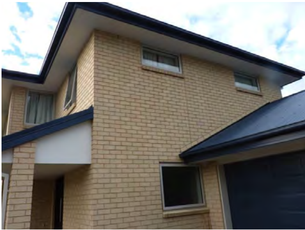
Careful design and construction meant this 2 storey masonry veneer house performed well, with only minor damage inside.