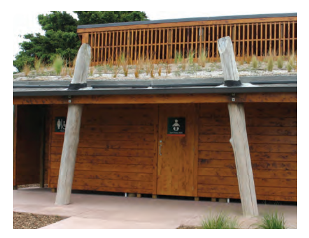
New Zealand toilet block with a green roof.

2.0.2 Green roofs, particularly on low-rise buildings, can contribute to a reduction of the 'urban heat island' effect. Their reduced solar reflection counters the increased temperature of urban hard surfaces.