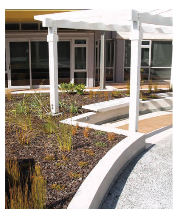
Public space green roof.

5.0.8 The drainage mat also acts to protect the membrane against physical penetration. Green roof-