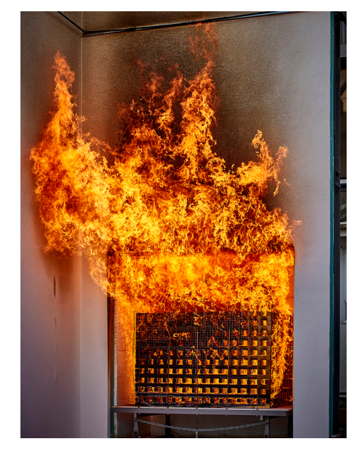
Figure 1. BS 8414 - combustion chamber

The requirement for testing to BS 8414 applies to external wall cladding systems for multi-level buildings other than Risk Group SH with a building height ≥ 25 metres.