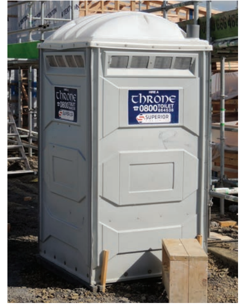
Toilet facilities must be available.

The person in charge of the business must ensure as far as reasonably practicable that: