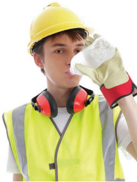
Drinking water must be available.