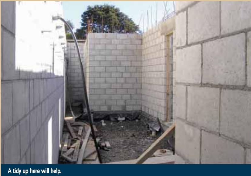
A tidy up here will help.

Need a hand? If you've got a building problem that needs fixing, get on the blower to Eddie Bruce at BRANZ advisory helpline!