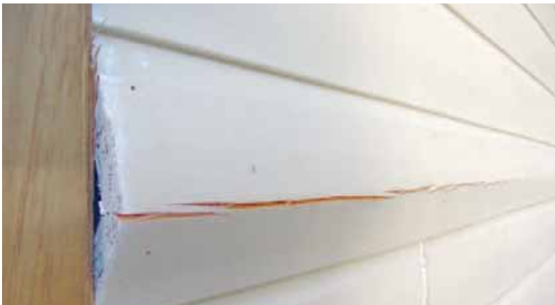
Figure 1: The cause of these badly cupped weatherboards can be seen in the lack of adequate expansion gaps at the top of each board.

End grain absorbs water or dries out faster than face grain, so corners, mitres, openings and running joints must be well sealed with paint or wax.