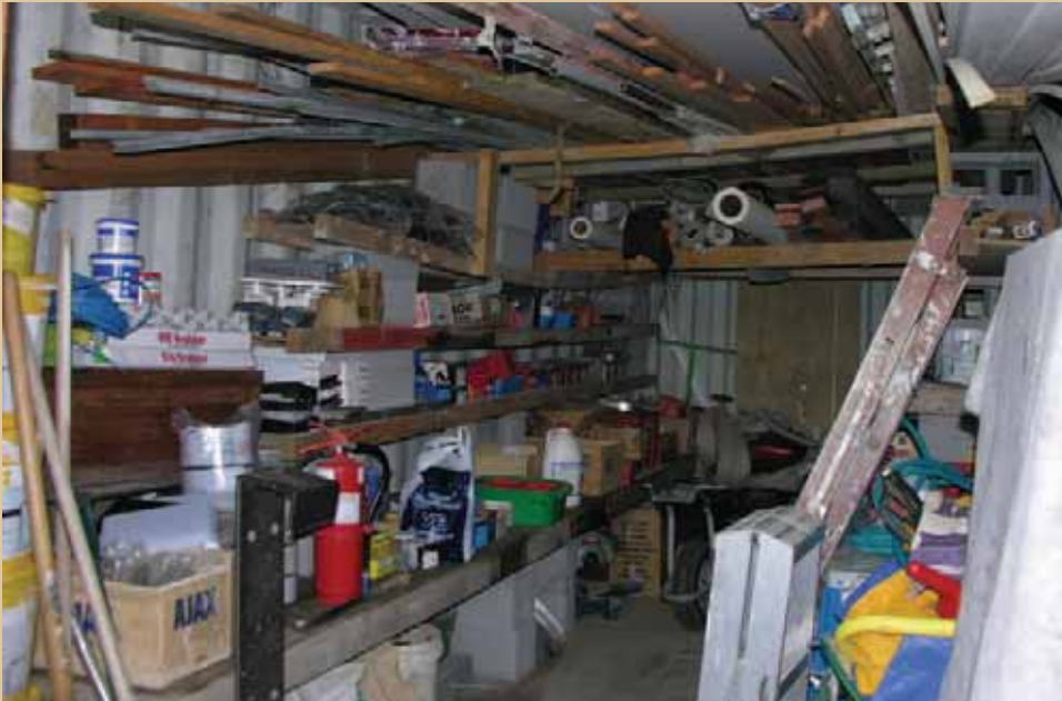
Proper storage makes work more efficient.