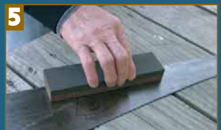
Rub a fine oilstone along each face of the saw to remove any burrs from filing.

With a 150 mm triangular file, file at a 45° angle to the blade with the handle of the file lowered a little to about 80°. Go down one side of the saw, not filing away more than half of the tooth's top. Going along the second side will make the tooth into a point.