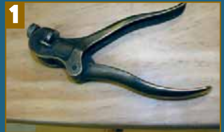
A setting tool has an anvil and a punch.

Last issue we showed you how to top and shape your saw. Now we set and sharpen it. If you set first, you may find that the teeth bend back slightly during sharpening. Setting the tool a half size bigger will compensate. Sharpening first creates the risk of damaging the teeth when setting. It's your choice.