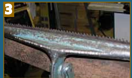
Arrange the saw so it is held about 3 mm above your clamp so it won't vibrate and screech as you file.

Lining up the punch with the middle of the tooth and squeezing will correctly bend only the top third. Warm the saw a little if it is cold or if you know the saw has brittle teeth.