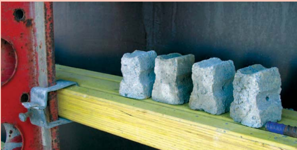
Concrete spacers are ideal for in-situ concrete walls.

There are specialist suppliers of heavyweight formwork systems who can help with the design and erection. The residential builder might be daunted a little by their commercial cousin's use of slims, divvies and she-bolts as everyday terms for formwork components. It might be an unfamiliar world of strong-shors, soldiers, Dywidags, snap-ties, Acros, pans, push-pulls and strong-backs but like most things in building, if the right processes are followed the right results will follow. Go and see the experts, listen to them and most of all follow their advice.