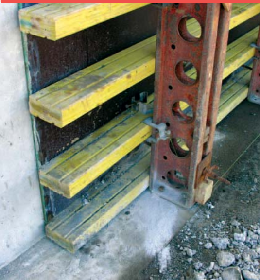
Through- and holding-down bolts in place.

Is building a large in-situ concrete wall the same as doing a small one ... only more so? The answer is definitely no. A small footing or retaining wall requires little engineering input, but it is a different story when the wall goes over a metre in height. Wet concrete produces immense forces against formwork and the consequences of failure are potentially very dangerous.