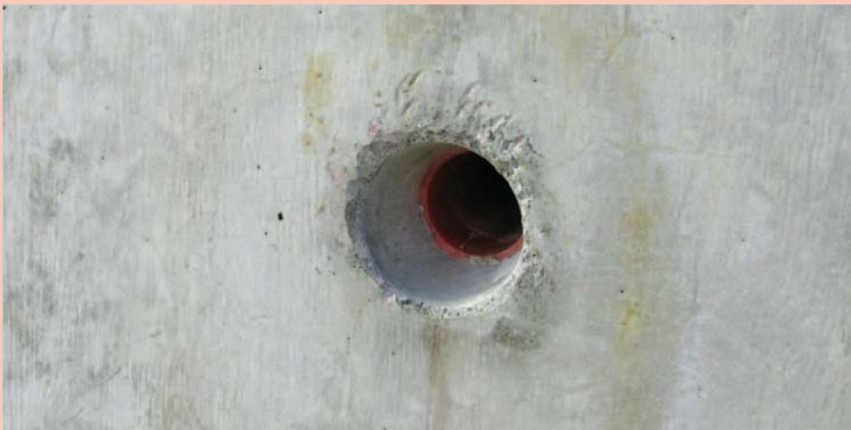
After stripping there there may be holes to grout. Note the high quality concrete finish.

Need a hand? If you've got a building problem that needs fixing, get on the blower to Eddie Bruce at BRANZ advisory helpline!